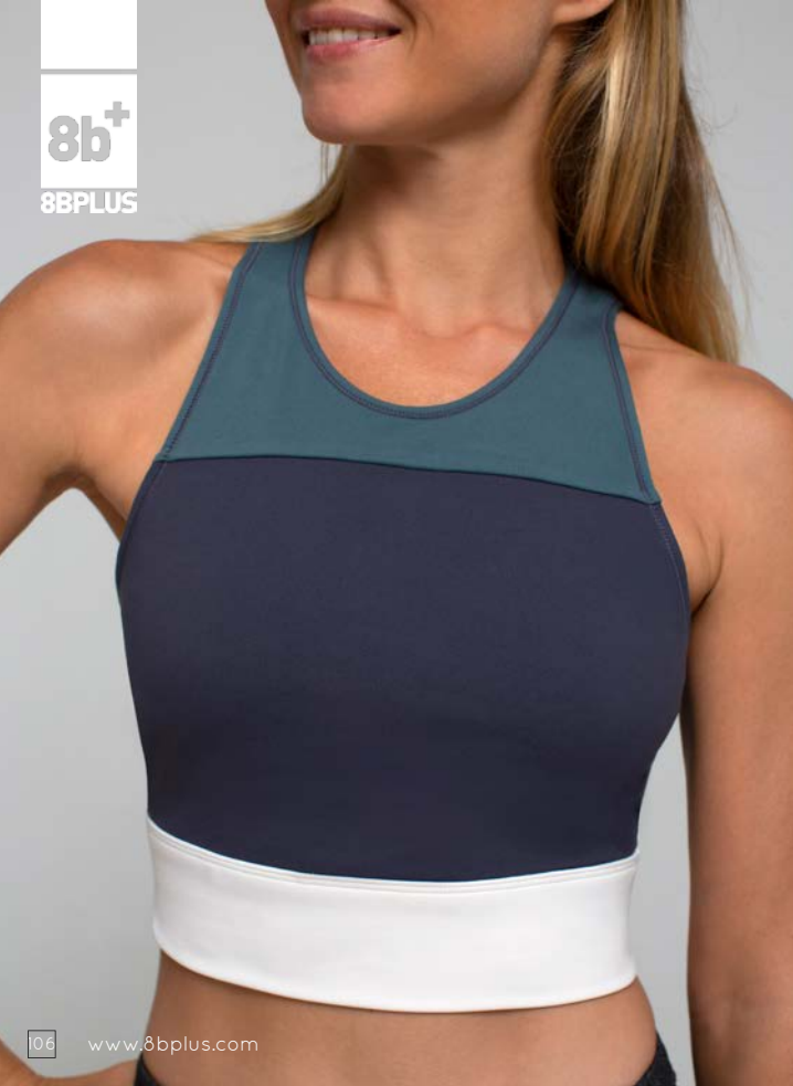
TOP: TENSION #601061