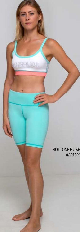
BOTTOM: HUSH SHORT #601091