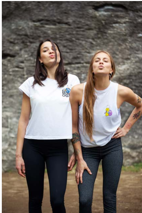
LEFT: EASY TEE / #610002 RIGHT: EASY TANK / #610001