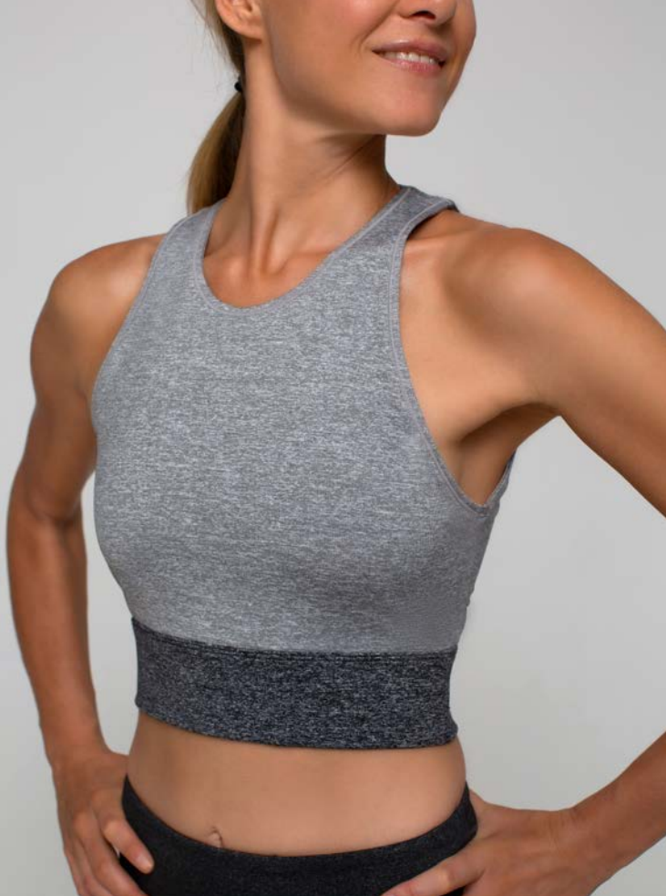
TOP: TENSION #601062