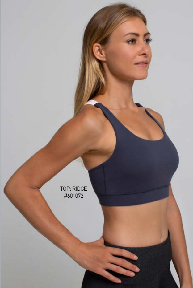
TOP: RIDGE #601072