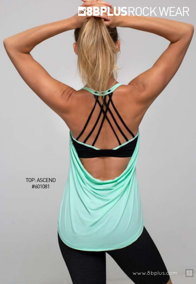
TOP: ASCEND #601081