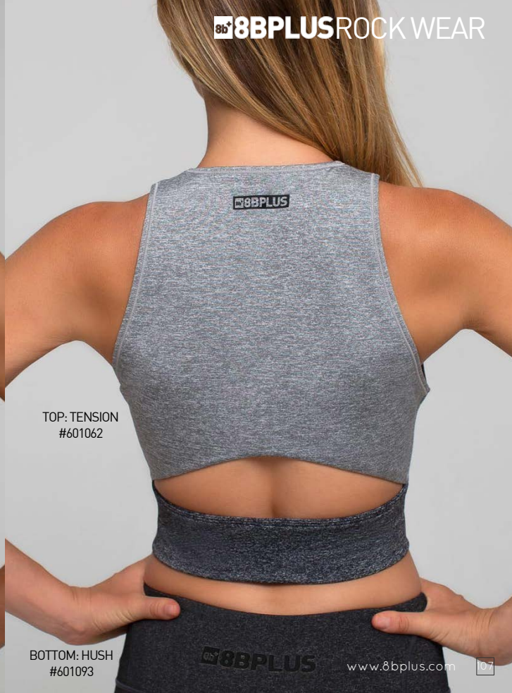
BOTTOM: HUSH #601093